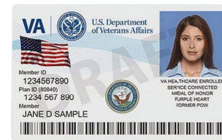
U.S. Department of Veterans Affairs Card: NOT ACCEPTED