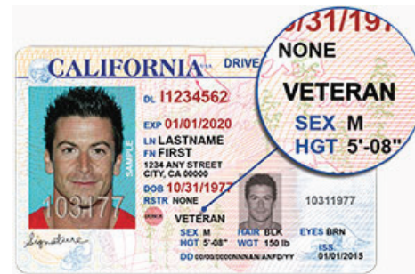
California Driver License with "VETERAN" label: ACCEPTED