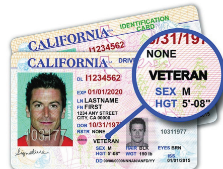
California Identification Card with "VETERAN" label: ACCEPTED